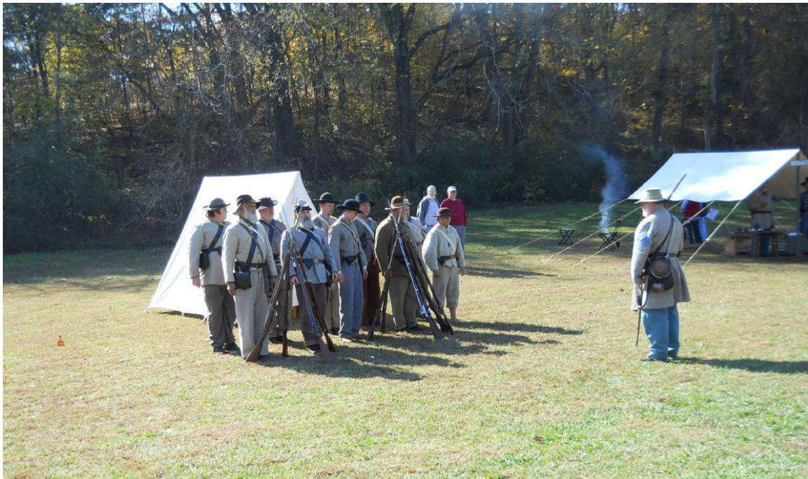
Confederate Bridge Guards.