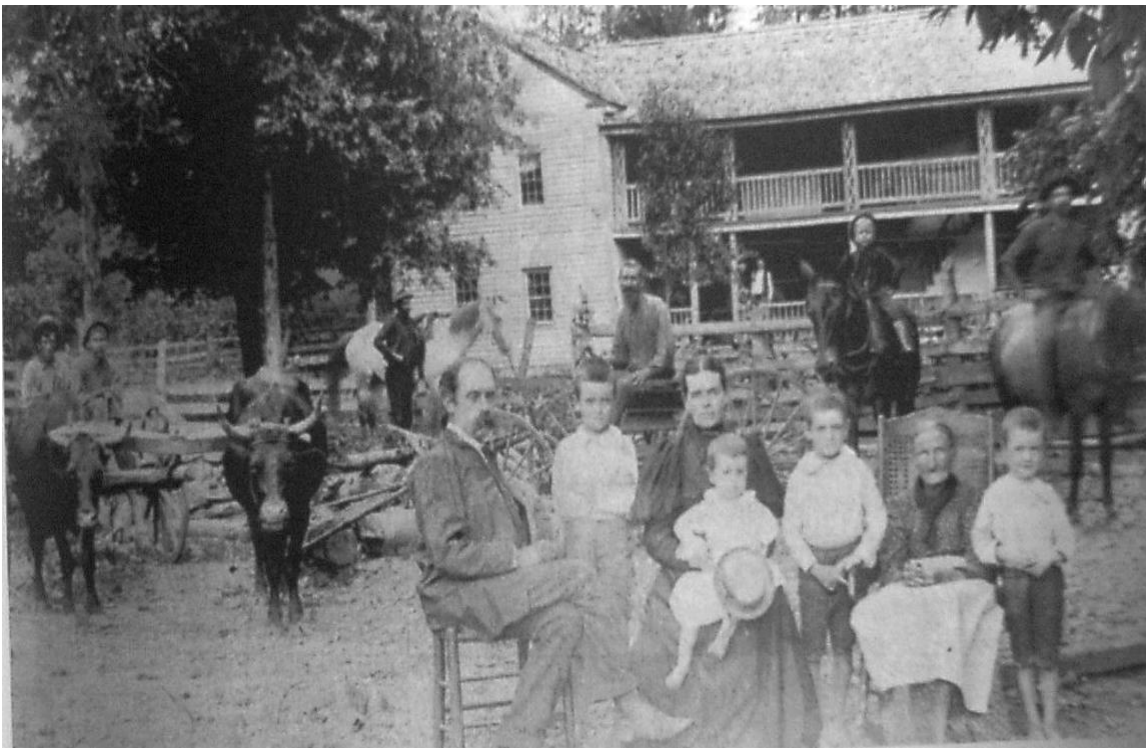
The Cole Plantation in Sligo Valley, Dade County, Georgia.