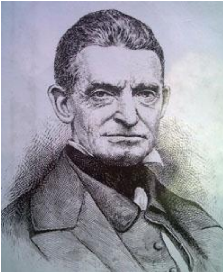
John Brown in 1854.

“It is useless to disguise the fact, that the entire North and Northwest are hopelessly abolitionized. We want no better evidence than that presented to us by their course in this Harper's affair. With the exception of a few papers (among them we are proud to notice that sterling Whig journal, the New York Express,) that have had the manliness to denounce the act as it deserved, the great majority have either sympathized with the offenders, or maintained an ominous silence.