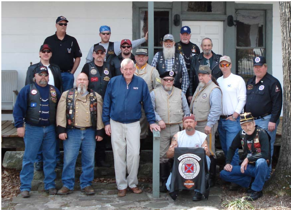
Georgia Mechanized Cavalry Quarterly meeting.