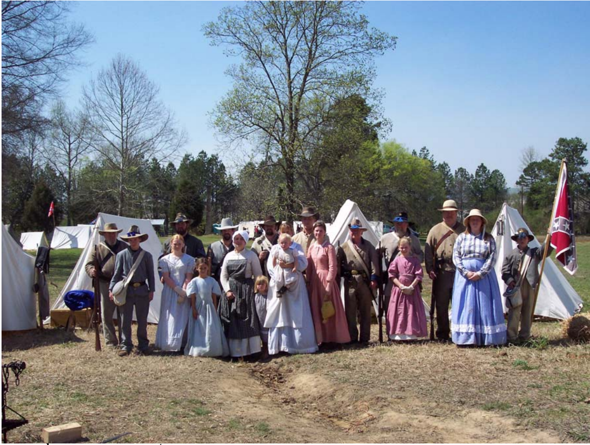
2 nd Company D, 1 st Confederate Infantry Regiment at Bridgeport, Alabama.