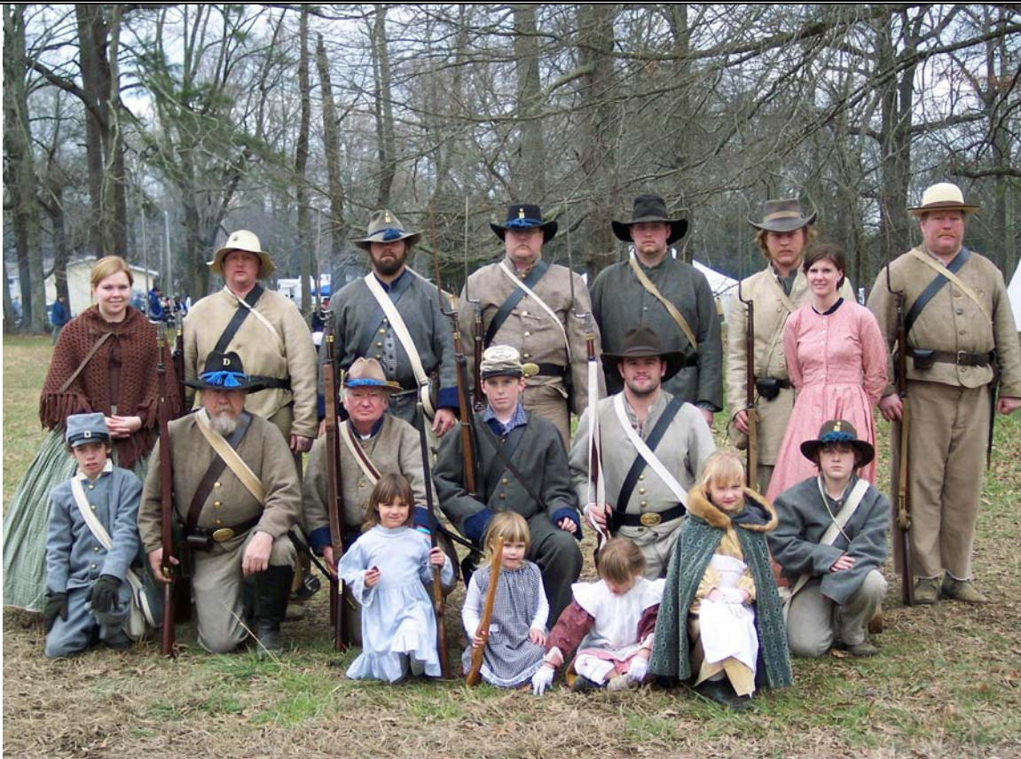
1st Confederate Infantry Regiment, 2nd.Co.D and Family at Bridgeport.