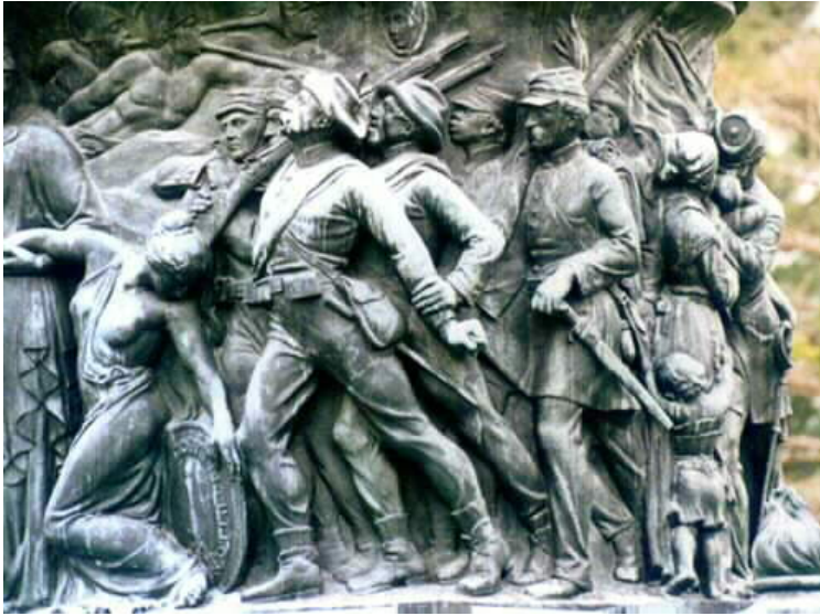
Detail on the Confederate Monument.

In 1906, the United Daughters of the Confederacy asked permission from William Howard Taft to erect a monument. Taft was at the time serving as the United States Secretary of War and was in charge of National Cemeteries. With his permission, the Arlington Confederate Memorial Association was formed and the ladies of the UDC were given authority to oversee work on the monument.