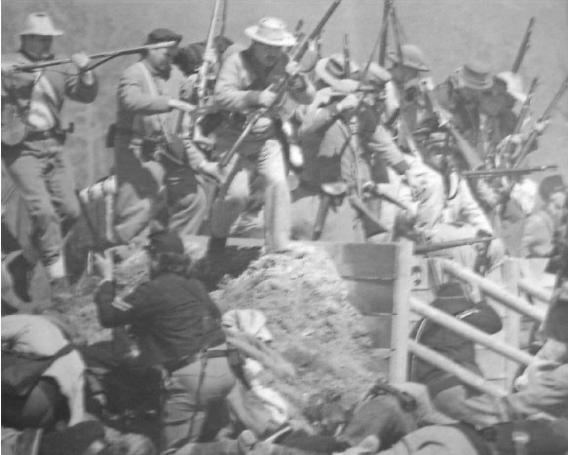
Storming the Federal Breastworks at Bridgeport.