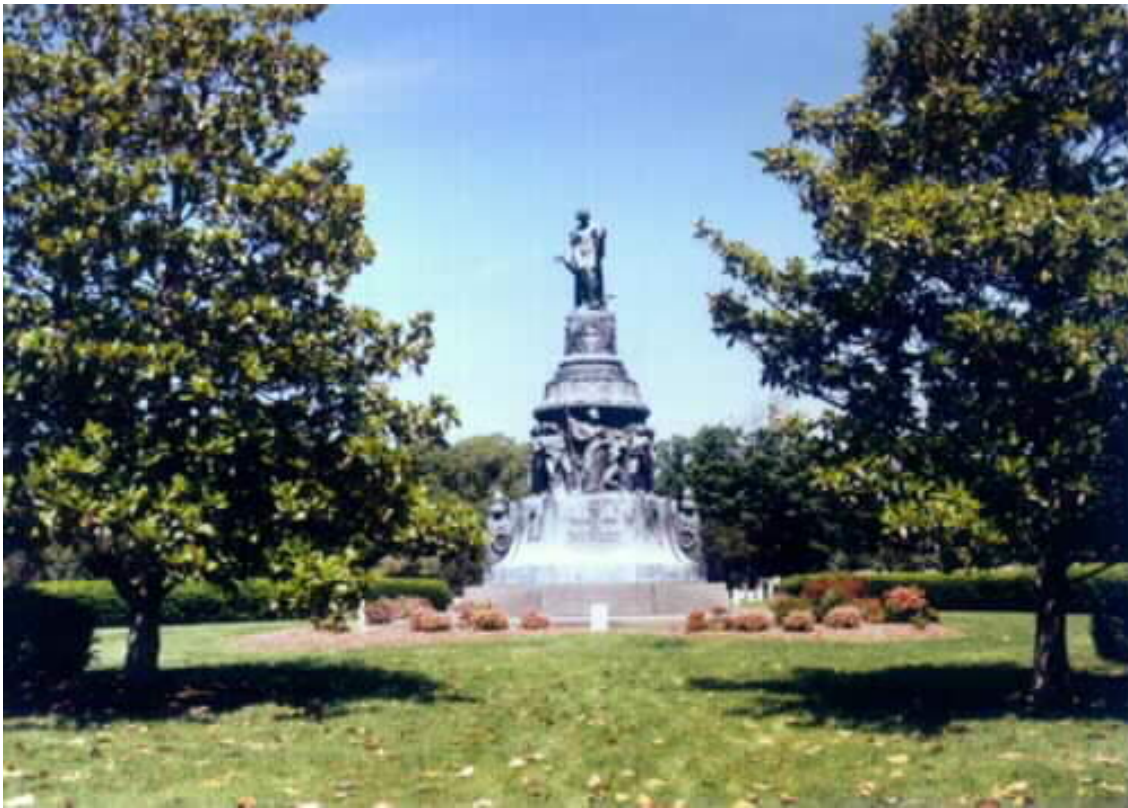
Confederate Monument at Arlington National Cemetery.

The world famous Arlington National Cemetery is located in the shadow of the Curtis-Lee Mansion (Arlington House) that was home to General Robert E. Lee and family until 1861 at the beginning of the War Between the States. This cemetery is on the Virginia side of the Potomac River; Washington, D.C. is across the river.